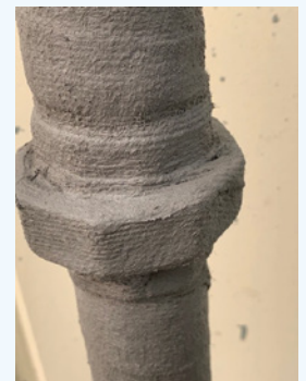
After 1000 hrs of ASTM B117-18 Salt Spray Test