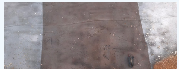
BEFORE Sandblasted white metal. Center coated in S2S